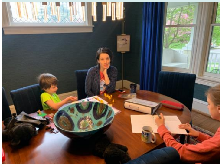
Logan Elementary School

Beginning the week after Easter, be on the lookout for some video teachings on the above. Who are they? What would they say about life in the time of Corona? These 20-30 minute videos will be part reflection and part meditation. Write down your questions, call/email/text me or wait until we are back together again.